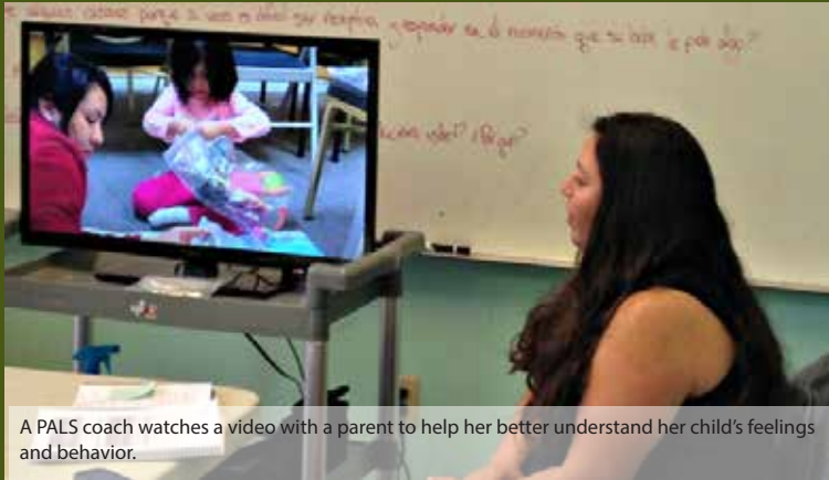
A PALS coach watches a video with a parent to help her better understand her child's feelings and behavior.

Because parents are a child's first and best teacher, PALS kids continue to have and benefit from positive interactions with their parents well into the teen years.